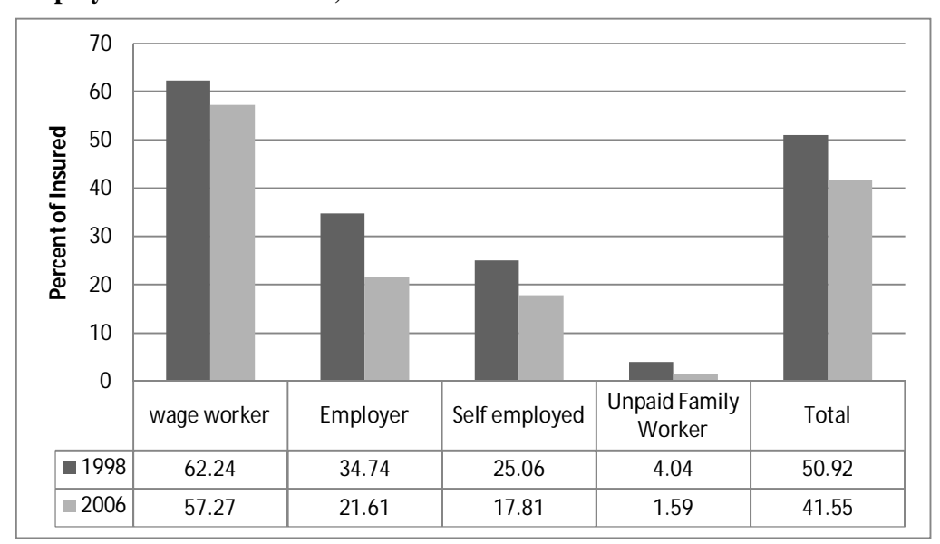
Figure 1: Percent of Workers (15-64 years old) who have Social Insurance Coverage by Employment Status in 1998, and 2006